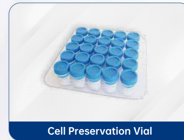
Cell Preservation Vial

The Easy-TLT Liquid-Based Cytology Processing Kit (SCT) is used for liquid-based cytology processing including preservation, transportation, and slide preparation of gynecologic specimens.